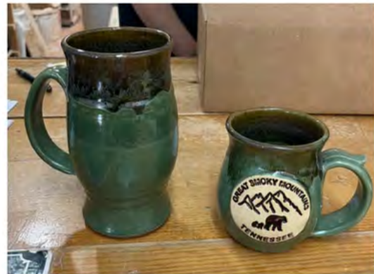
Travel Mug and Belly Mug