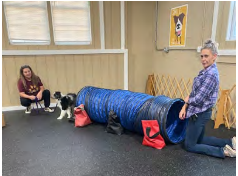
Last Session Puppy Class From left to right: Finley, Zava, Raven, Moira