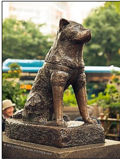
Hatchiko - Tokyo, Japan