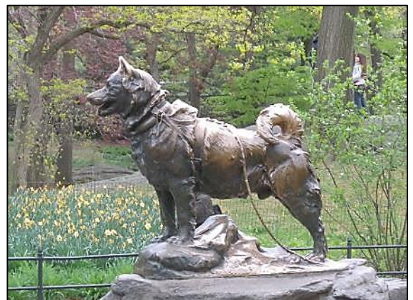
Balto - NYC