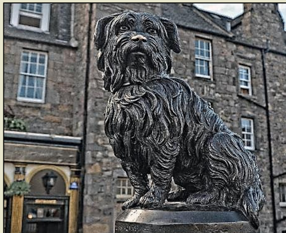
Greyfriars Bobby – Edinburgh, Scotland

Announcements - p. 1 Meeting Minutes – p. 2 Volunteer Needs – pp. 3-4