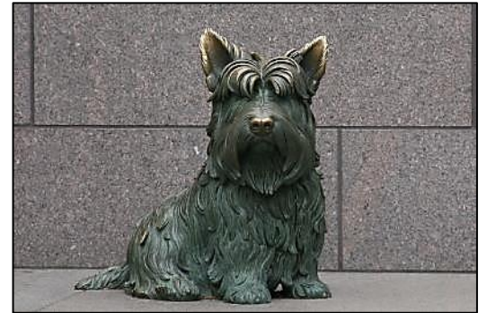
Fala - Washington, DC